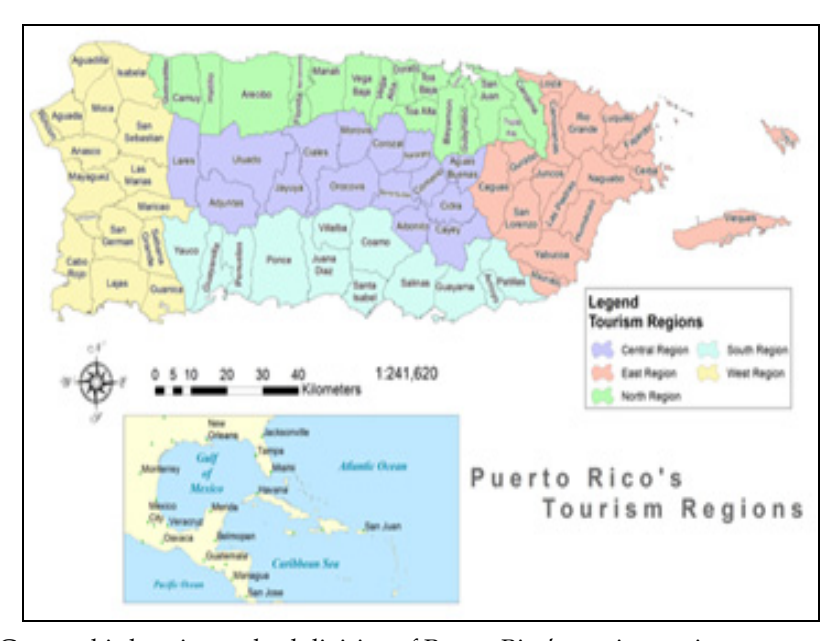
Fig. 1. Geographic location and subdivision of Puerto Rico's tourism regions.

expanding industry that has substantially contributed to increase employment rates around the world, has represented a significant source of revenue (WTTC, 2005, 2011), and is projected to keep expanding over the next decade. The total number of visitors in PR increased from 4.6 million visitors in 1999 to nearly 4.9 million in 2010 (PRTC, 2011). The number of tourists staying on hotels increased by 28% between 1999 and 2010. Total tourism-related employment increased from 30,225 in 1985 to 54,656 in 2010, or by a factor of 81%. The total amount of employees directly working on hotels increased from 7,300 in 1985 to 12,800 in 2010, or a magnitude of 75%. Overall hotel room availability increased by a factor of 27%, from 11,061 in 1999 to 14,076 during 2010. Overall number of hotel facilities increased by a factor of 15%, from 137 in 1999 to 158 during 15 2010. This has evidently triggered a recent large boom in construction of tourism facilities, but also has launched a major increase in urban development along coastal zones, often intermingled with tourism facilities targeting almost exclusively the upper economic classes.